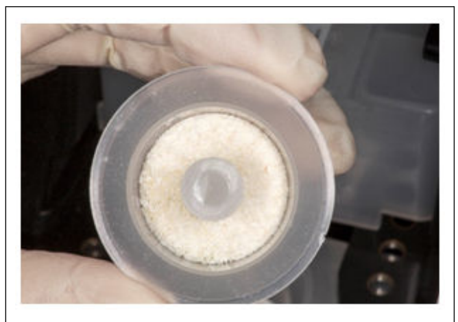
Figure 12: The inal gra t material.