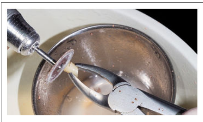
Figure 7: Tooth sectioning by new disc.

After that with a new disc we started to carefully section the tooth into small portions in order to avoid the blockage of the device with large tooth particles, especially during cutting the enamel in order to prevent deterioration and cracks. During the tooth handling we keep abundant irrigation with saline (Figure 7).