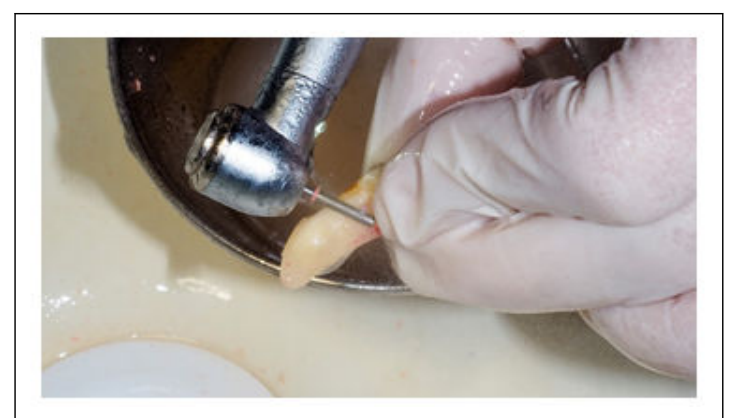
Figure 6: Cleaning the tooth from adhered organic material and periodontal rests.

As the protocol used in several studies, the tooth is being cleaned with saline and polished to wash out all the organic material present on its surface from the remaining periodontal ligament, then the pulp tissue is removed gently using a diamond bur. We dried the surface with sterile gauze and air to prevent any oil contamination (Figure 6).