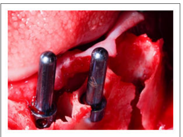
Figure 15: Cheking implants paralelity.

We had previously decided to use Zirconia implants due to its high biocompatibility, aesthetics properties and soft tissue integration [15-19].