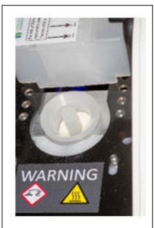
Figure 11: Tooth grinded.

The whole process lasts 40 minutes approximately and after the grafting material is ready, we check that the particles diameter is between 300 and 1200 microns (0.3 to 1.2 millimeter) (Figures 11 and 12).