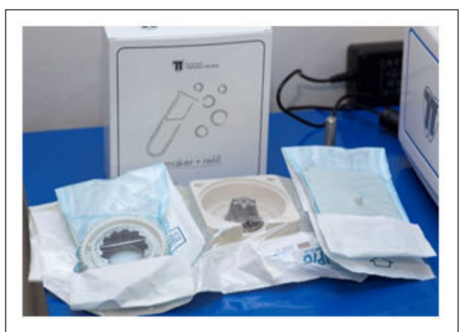
Figure 8: Tooth Transformer devices.

In our case we used the automated device Tooth Transformer that splits the tooth into portions between 0.4 to 0.8 millimeter, small tooth pieces were then inserted in the mill area of the device (Figure 8- 10).