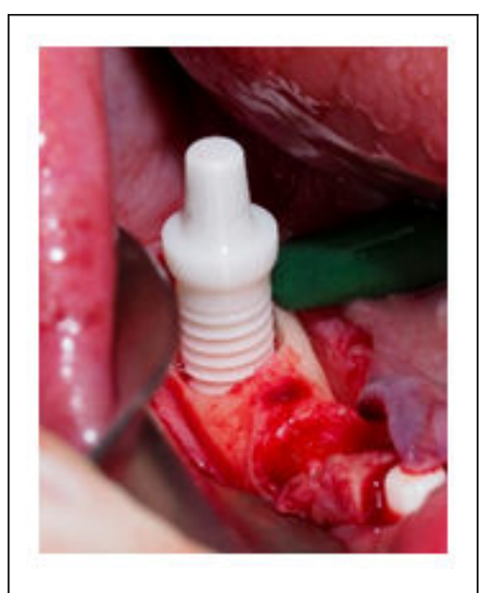
Figure 19: Implant insertion.