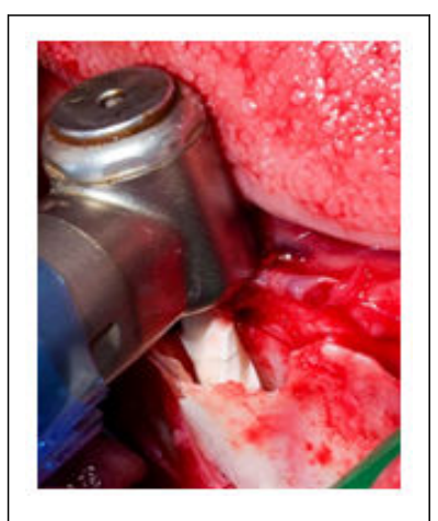
Figure 17: Insertion of the implant.

Saline solution is used to treat the surface of zirconia implant with the aim of reducing the quasi-static fracture strength (Figure 17-20).