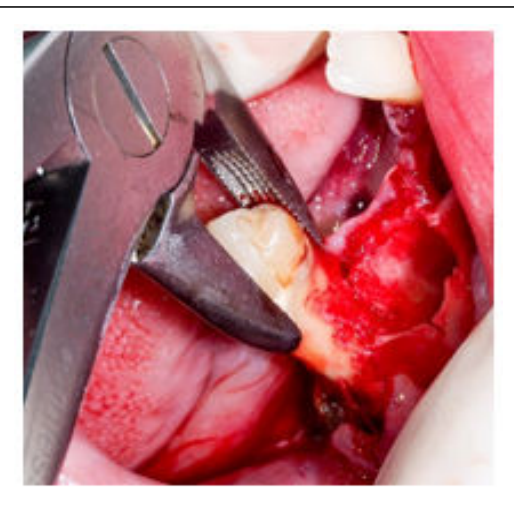
Figure 3: Extraction of lower premolar.