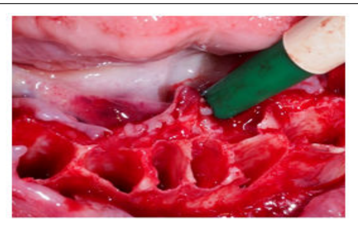
Figure 4: Remaing bone after extractions were performed. Sound teeth were then taken for the further procedures (Figure 5).