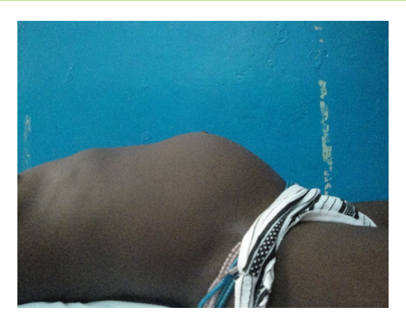
Figure 4 Abdomen distended, soft, non-tender, and mass in the right side, mobile, 14 × 17 cm, firm, smooth surface.

Pulse is 90 min, Blood pressure 90/60 mmHg.