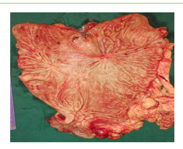
Figure 1 Gross specimen: three shallow ulcers distributed at gastric fundus, body and antrum.

demonstrated immune-reactivity for vimentin and S-100, which established the final diagnosis for GEG (Figure 3).