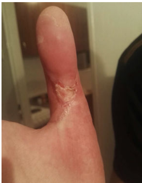
Figure 5: After 3 weeks treatment.