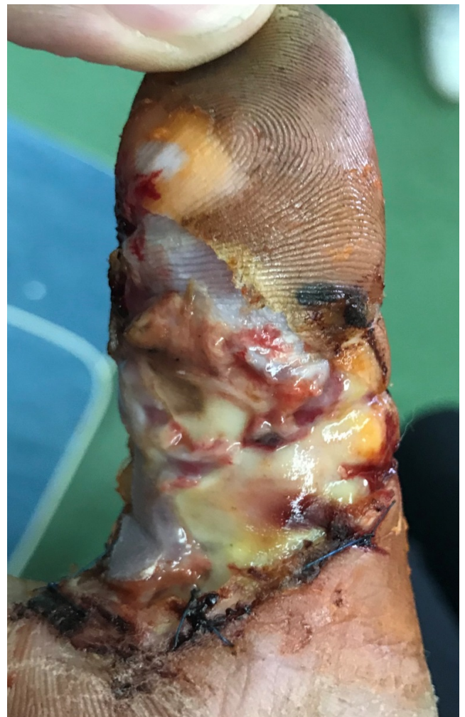
Figure 1: At the patient's second control, 2 weeks after the injury.

Two weeks after the injury ( Figure 1 ), the patient, a healthy young student with no history of any chronic diseases, came to control for the second time.