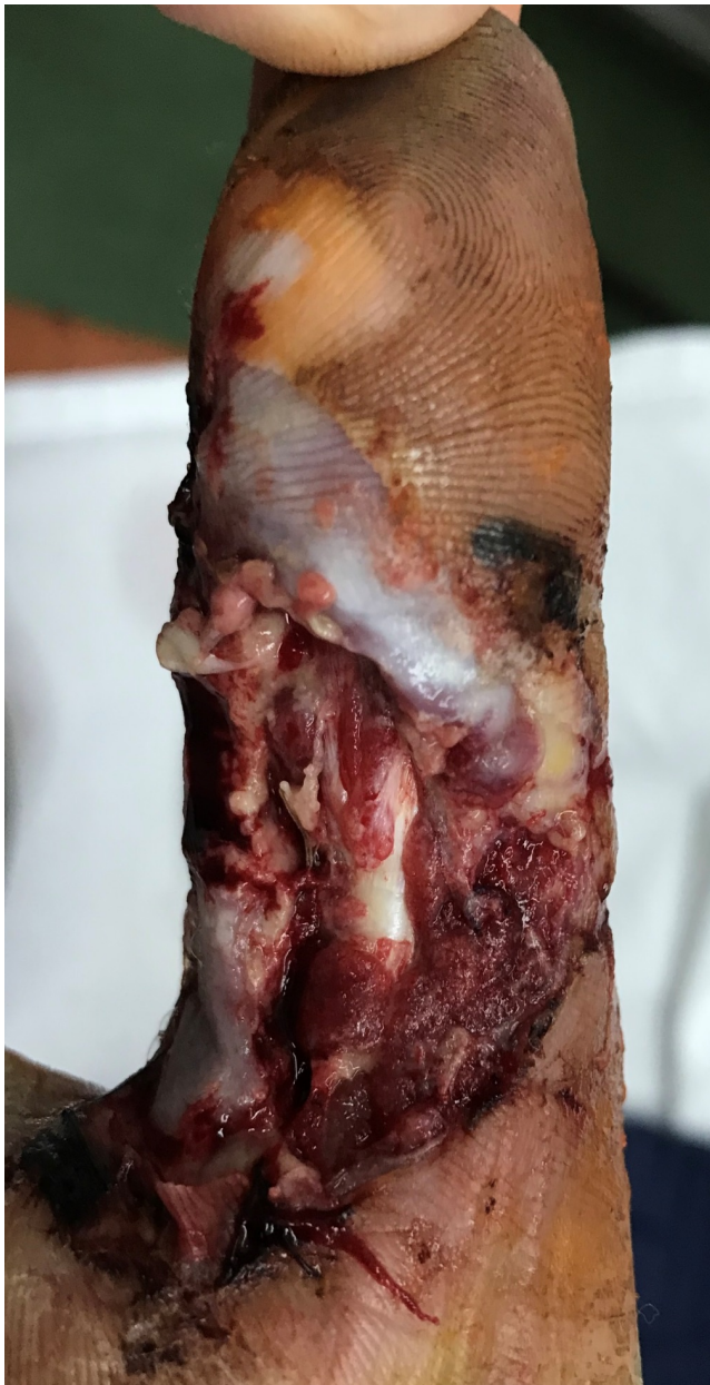
Figure 2: After debridement.

Should we take a bacterial wound culture and Gram stain? Or should we admit the patient to the hospital gave him IV antibiotics, analgesics and do the debridement or even amputation? Or will all of it and in the same order be necessary? The surgical intervention had been done – urgently – debridement to the healthy, bleeding tissue, without anesthesia ( Figure 2 ).