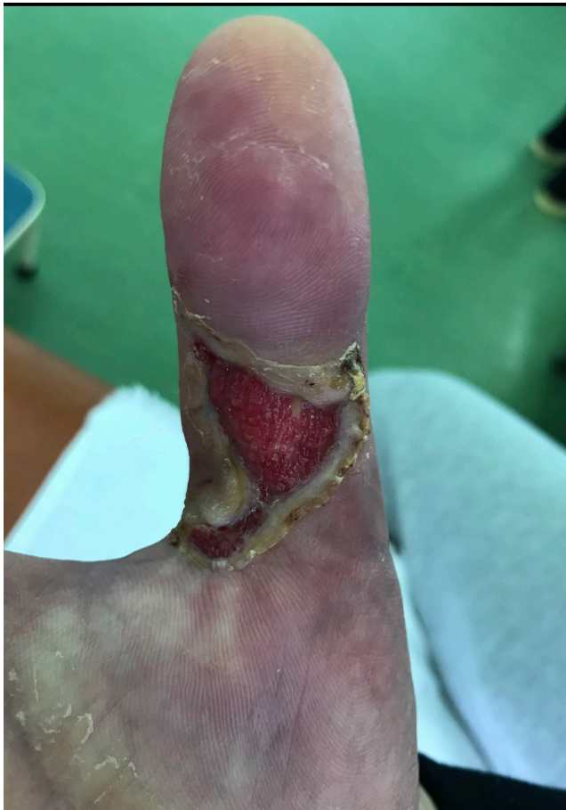
Figure 4: 2 Weeks after second debridement.