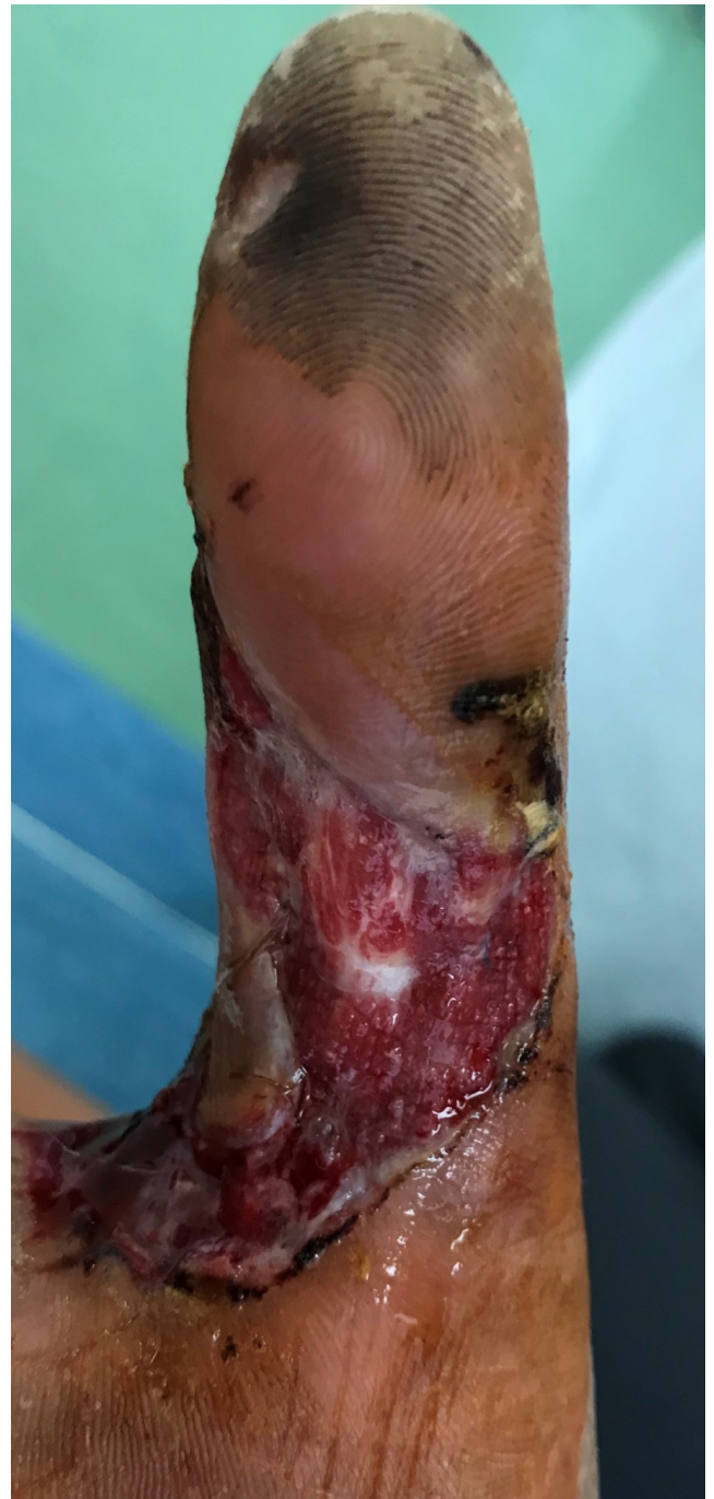
Figure 3: After the second debridement.

Three days after the first, followed the second debridement ( Figure 3 ) and weeks after second debridement ( Figure 4 ). The patient did well and has not had any complications (i.e., contractures) ( Figure 5 ).