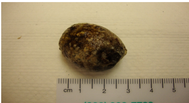
Figure 2 A 3 cm-sized gallstone was removed during the emergency cholecystectomy.

flora such as Escherichia coli , Klebsiella pneumoniae , Pseudomonas aeruginosa , or anaerobic streptococci [1-4].