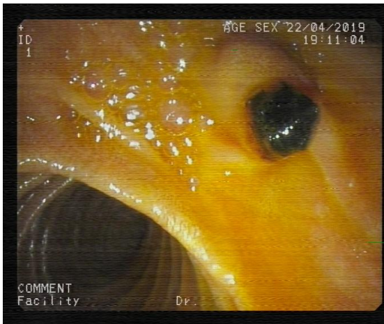
Figure 1: Papilla with protruding dark foreign body.