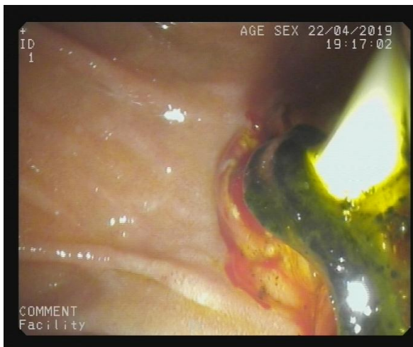
Figure 2: Extraction of elongated foreign body out of the CBD using Balloon.