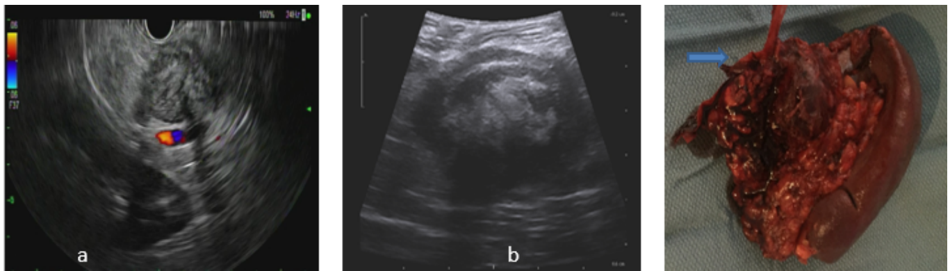
Figure 2 An endoscopic ultrasound picture is shown in 2a; it demonstrates the close proximity of the solid mass to the splenic vessels located just posterior to it. Figure 2b shows the intraoperative ultrasound of the mass which demonstrates similar findings. A thick hypoechoic capsule is seen around the mass. The mass (marked with*), was removed en bloc with the distal pancreas (blue arrow marks the cut edge of the pancreas), and the spleen, as shown in Figure 2c.