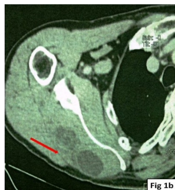
Figure 1b Cystic mass of the right scapular region.

Abdominal ultrasounds identified no other sites of the hydatid disease. Hydatid serological test was negative. Surgical resection of this mass was decided. Preoperatively, the cystic mass involved in the infraspinus muscle and was surrounded by a thick fibrous capsule. Complete pericystectomy was safely performed. The macroscopic examination confirmed hydatid cysts with daughter vesicles.