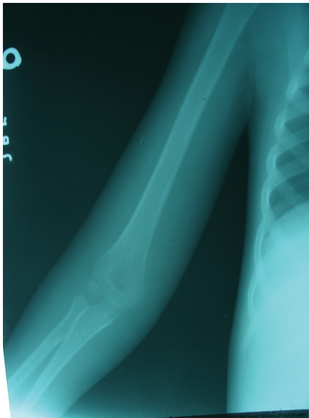
Figure 2 X-ray image of the arm illustrating the second case.

of all cells present in the vessel and finally and abnormalities of the vascular texture and \text{NO}_2 metabolism [2].