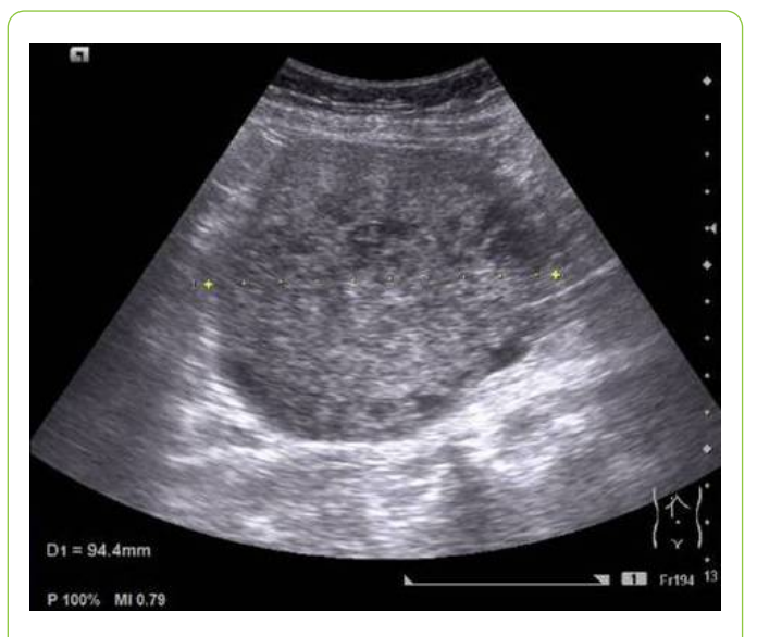
Figure 1 Ultrasound image demonstrates a well-defined lesion heterogenous with multiple hypoechoic region within suggestive of necrosis.

LPD is a benign condition. However, cytological atypia, nuclear polymorphism, hyperchromasia, tumor cell necrosis and increased mitotic figures are histological signs of malignant transformation. Some cases of malignant transformation in patients suffering from LPD have been reported and the incidence is unknown. In a review of 103 case reports, Beckers described six cases with malignant leiomyosarcoma diagnosed shortly after the diagnosis of LPD was made [11,12].