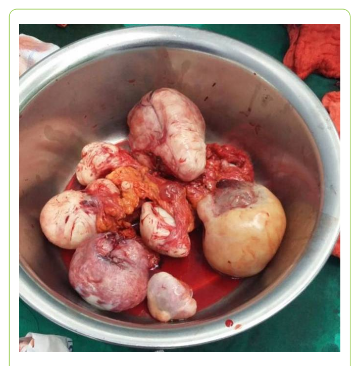
Figure 3 Leiomyomatosis peritonealis disseminata nodules resected from the mesentery and omentum of various size.

Many authors advocate a conservative approach in women with reproductive age. Reducing exposure to estrogen is sufficient to cause regression of LPD. LPD exhibits a benign biological behavior, and the decline in sex hormone levels in the body leads to regression of the disease Regression of LPD was reported with hormonal therapy using gonadotropin-releasing hormone (GnRH) agonists, megestrol acetate, and danazol. Recurrence of LPD has been reported even after a radical surgical approach surgical treatment may include exploration and debulking surgery. Recurrence of LPD has been reported even after a radical surgical approach.