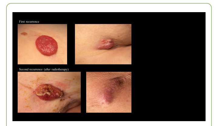
Figure 3 Clinical aspect clinical aspect of tumour: above: first recurrence; below: second recurrence, 3 months after radiotherapy.

EPCs are not clinically distinctive and mostly described as verrucous plaques or polypoid growths, often clinically misdiagnosed as squamous cell carcinoma, Bowen's disease, seborrheic keratosis or pyogenic granuloma. The lesions can be erythematous to violaceous in colour. Porocarcinoma has a tendency to be more exophytic and ulcerative compared to poroma [16] (Figure 3). Biopsy is mandatory for a correct diagnosis.