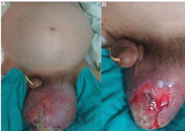
Figure 3 Photographs show the volume of the abdominoscrotal hydrocele decrease after 4 weeks of treatment (A and B).