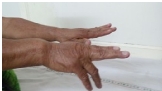
Figure 1 Metacarpophalangeal joint.

Thorough examination revealed a swelling over the dorsal aspect of wrist on the ulnar side. Patient was unable to actively extend her right little and ring fingers at the metacarpophalangeal joint ( Figure 1 ).