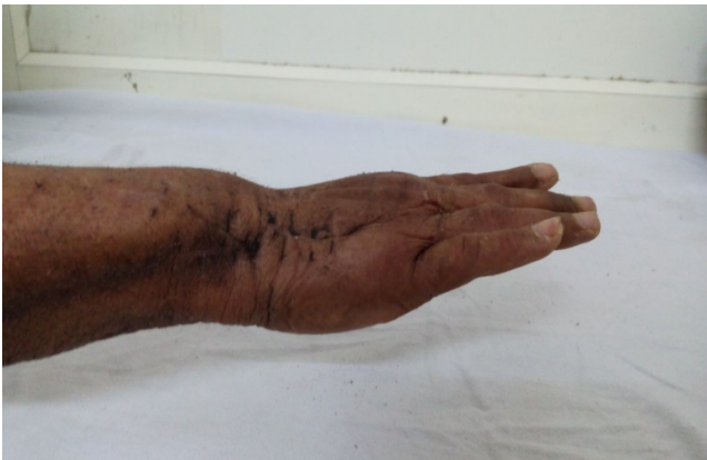
Figure 6 Finger ruptures.