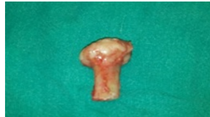
Figure 4 Finger linearity.