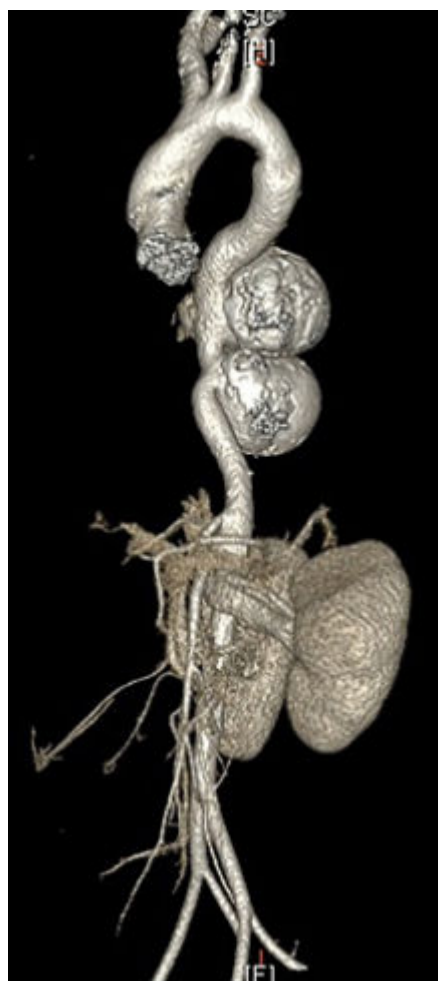
Figure 1 Computed tomography image from Case 1. Computed tomography showed two aneurysms in the middle part of the descending aorta.

ventricular end-diastolic diameter of 36 mm and ejection fraction of 66.6% [1,2].