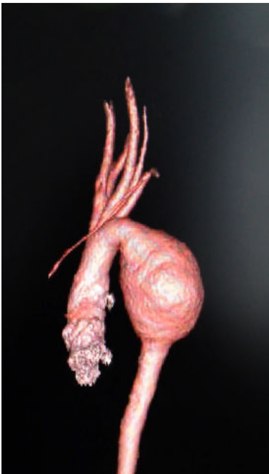
Figure 2 Computed tomography image from Case 2. Computed tomography showed a large thoracic aortic aneurysm.

A 7-year-old girl (body weight, 20 kg) was diagnosed with a TAAA and NOTCH1 gene mutation [3]. Computed tomography revealed a large TAAA (maximal diameter, 43 mm) and depression of the pulmonary trunk and left pulmonary artery ( Figure 2 ). Echocardiography demonstrated a left ventricular end-diastolic diameter of 37 mm and ejection fraction of 68.9%.